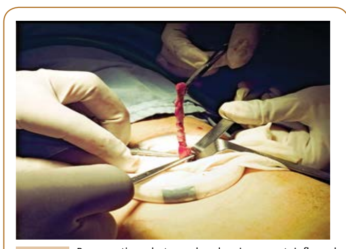
Figure 1b Peroperative photography showing a not inflamed appendix.

was discharged home on the 11<sup>th</sup> post-operative day, and is now at 2 years of follow-up.