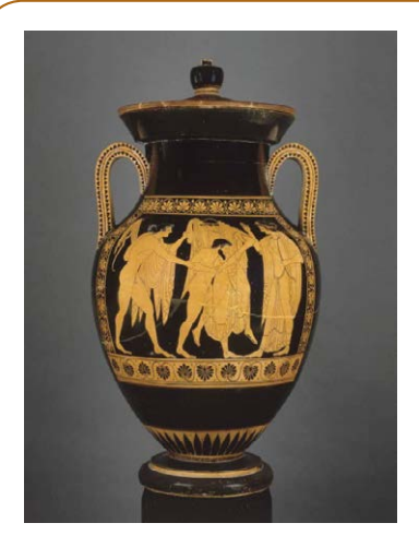
Figure 5 Apollo, Tityus, Leto and Artemis, Athenian red figure krater ca 5<sup>th</sup> BC, Musée du Louvre.