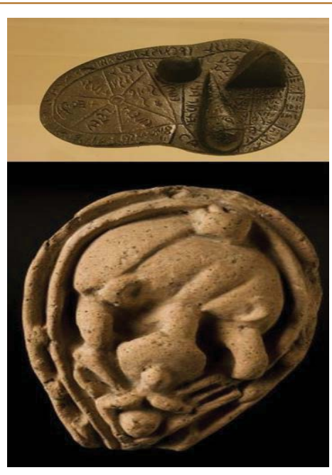
Figure 6 Etruscan model liver, most probably for divination purposes (top side), and Roman votive torso viscera depicting gastrointestinal tract and hepar, ca 1st to 5th century AD (bottom side).

Abdominal surgery and in particular hepatic surgical operations were being performed by important medical figures in ancient Greece. Meanwhile war surgeons had adequate knowledge on human's anatomy, acquired by the treatment and observation