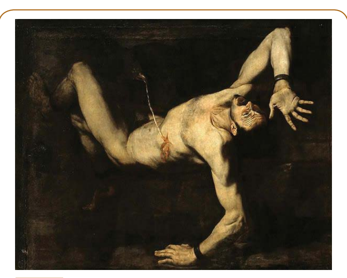
Figure 4 Tityus the son of Jupiter and Elara is shown chained to a rock in Tartaria, painting by Jusepe de Ribera in 1632, from the Museo del Prado.