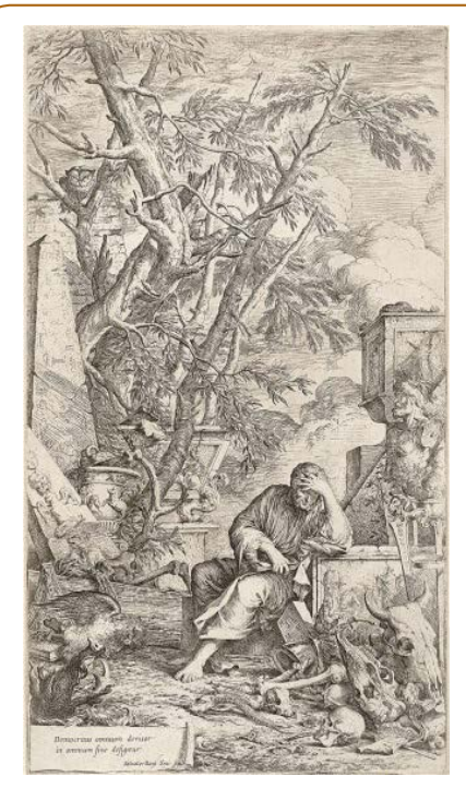
Figure 8 Democritus surrounded by dead animal samples in meditation by Salvator Rosa, Rome 1662.